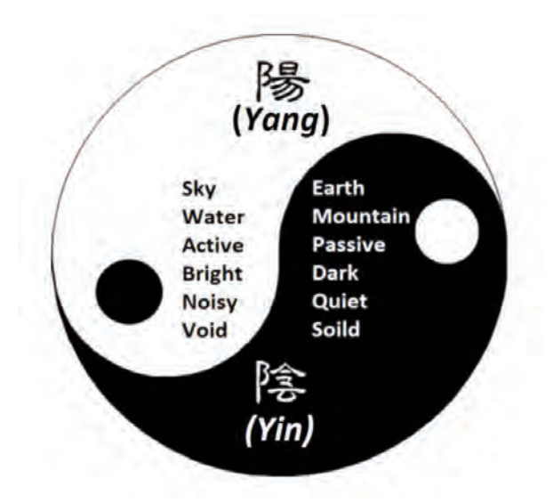
Figure 1. The harmony between yin and yang.

Shui rules are somehow unreasonable. Most of the Chinese do not admit that they practise Feng Shui based on superstition but in fact humankind just needs a way to sustain healthily. According to Xu (1998), treating anything that is partly understood as superstition is not a scientific manner of finding truth. Feng Shui may have supportive values for physical and mental well-being in a practical way rather than strictly superstition. Teather & Chow (2000) highlighted that Feng Shui is connected to human well-being by its visual—psychological implications. It induces environmental planning in accordance with human subjective feelings about, especially essential in a sleep environment.